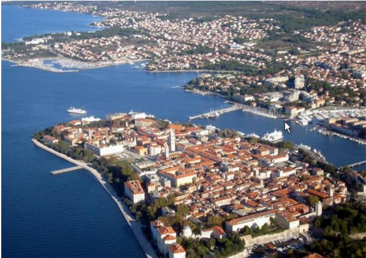
Figure 3: City of Zadar