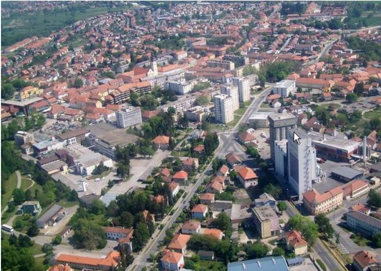
Figure 2: City of Cakovec

All of the towns have put flyers and leaflets in places of info desk or information centers for citizens, offices for the collection of utility bills and on the websites.