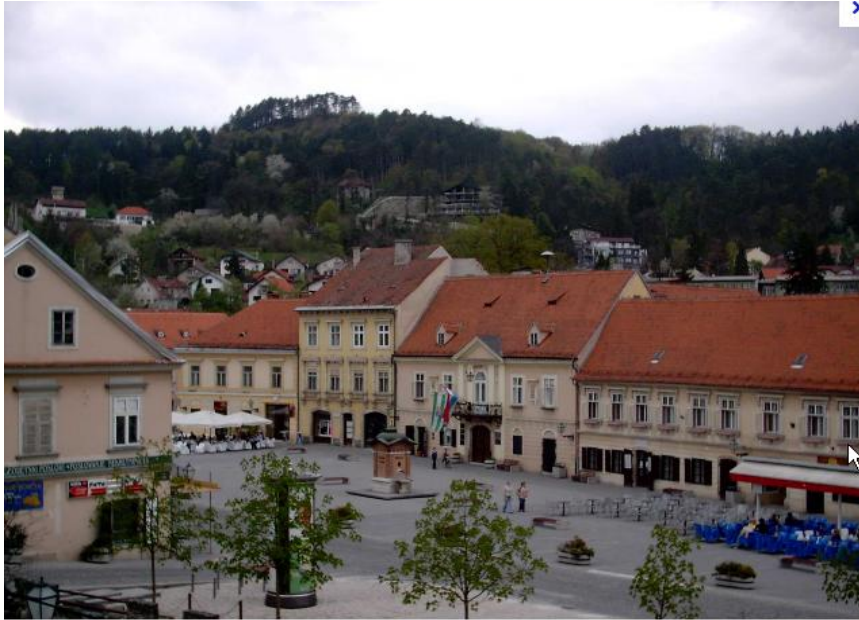
Figure 1: City of Samobor

One of the visited towns was Samobor, which has 40,618 inhabitants, and informed the city information center representatives about COL project.