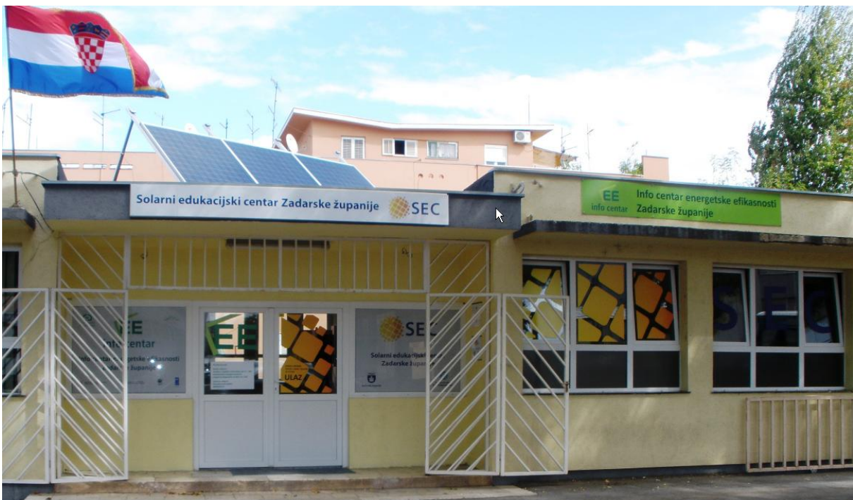
Figure 4: UNDP info center in the city of Zadar

One of the planned activities in Croatia relates to a seminar, organized with UNDP office representatives in Zadar.